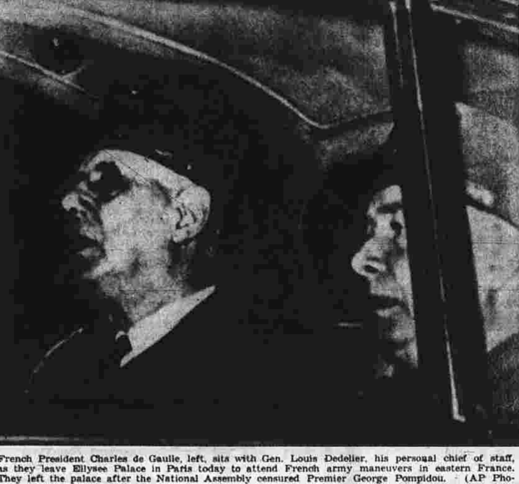
French President Charles de Gaulle, left, with Gen. Louis De Gaulle, his personal chief of staff, as they leave Elysee Palace in Paris today to attend French army maneuvers in eastern France. They left the palace after the National Assembly censured Premier Georges Pompidou.

WASHINGTON (AP)—Having ruled out direct military action to smash the growing Communist base in Cuba, President Kennedy has embarked on a strategy of active economic warfare against the Castro regime.