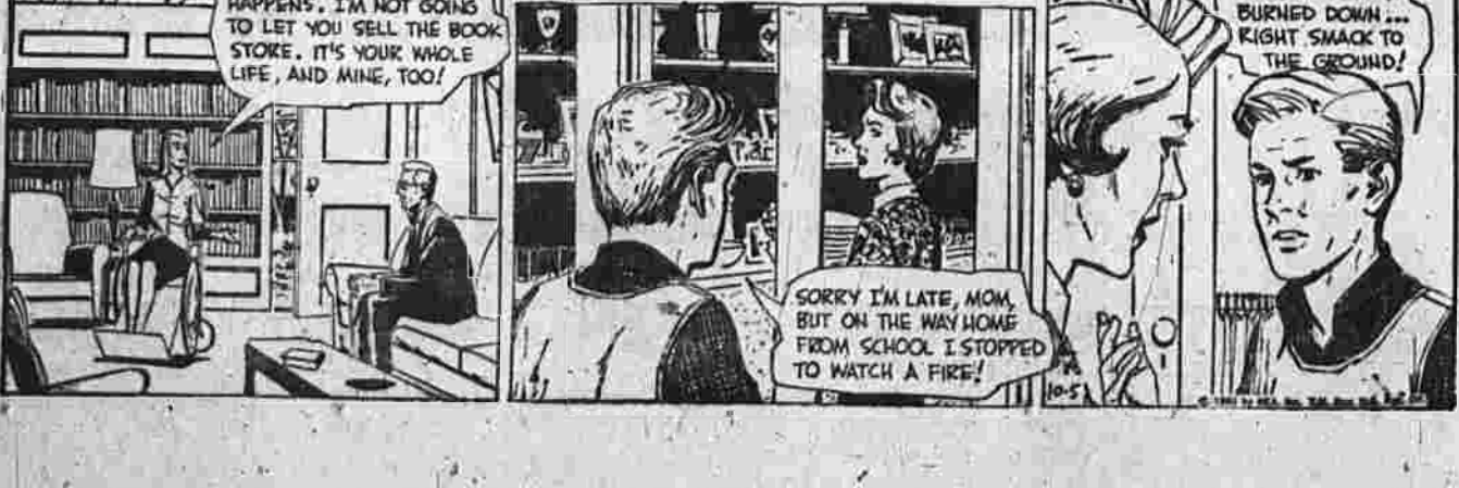
THE STORY OF MARTHA WAYNE