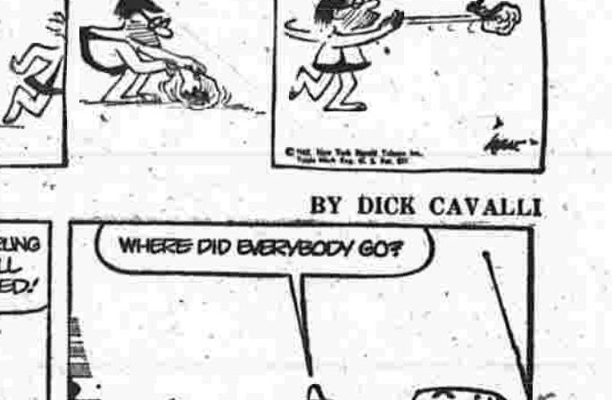
BY JOHNNY HART